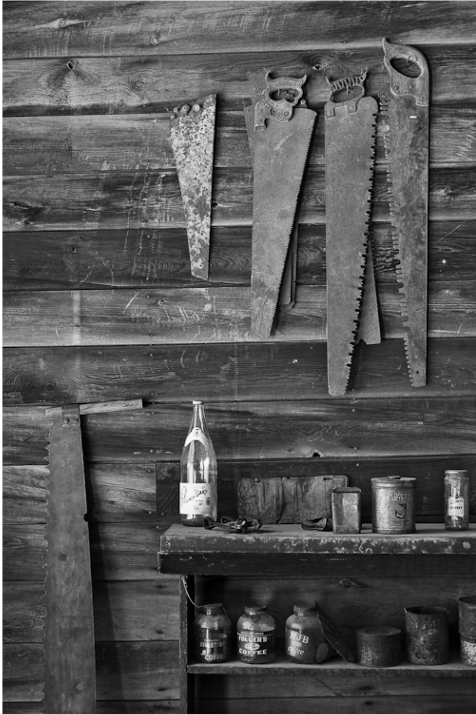
Shopping At The Merchantile