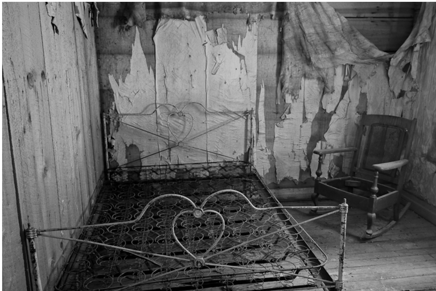
Wells Hotel Guest Room