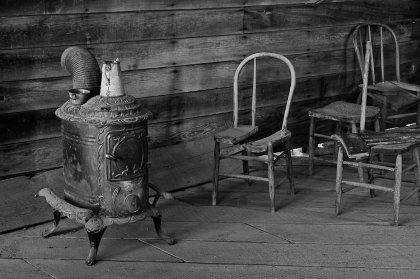
Sitting By The Fire