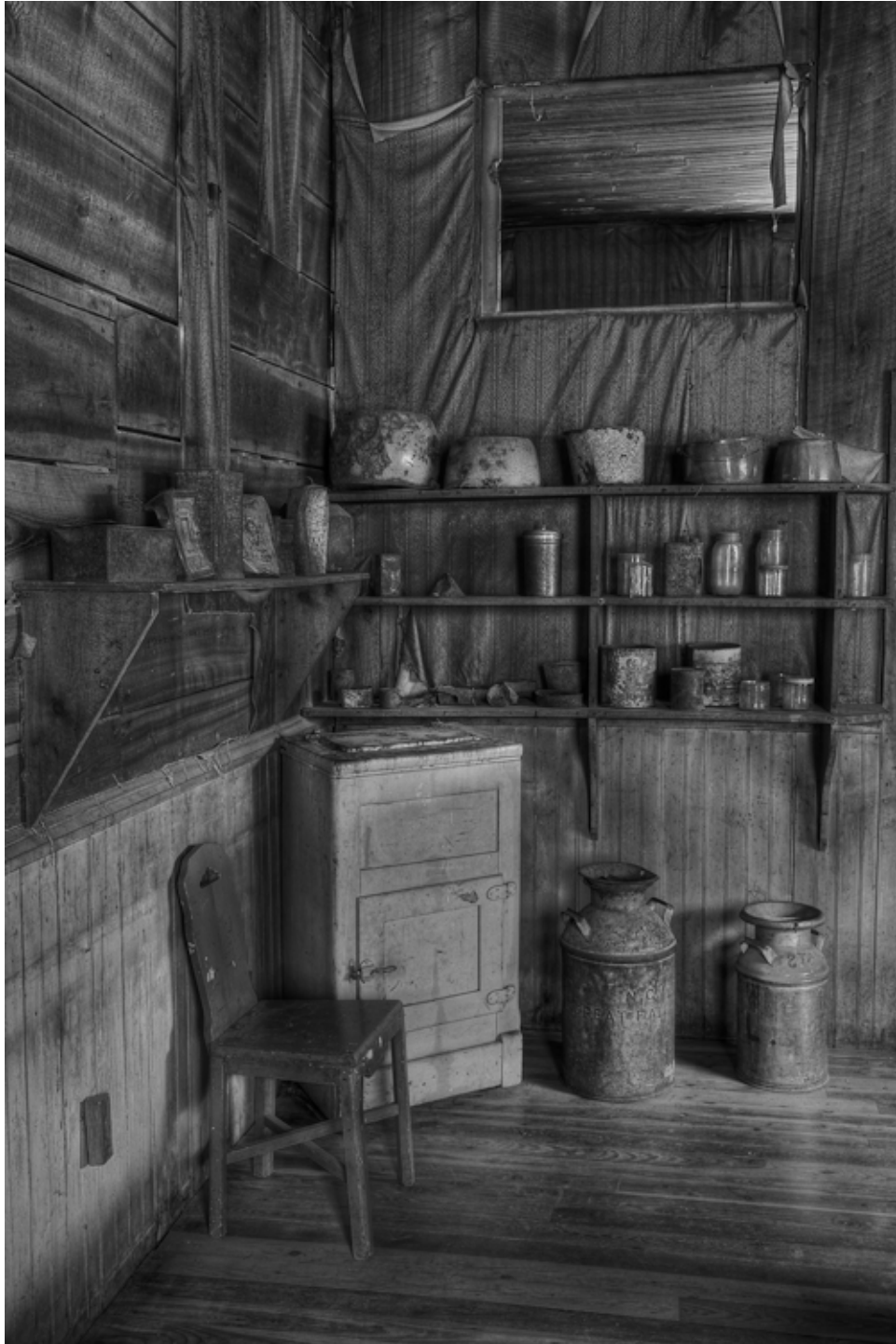
Wells Hotel Kitchen