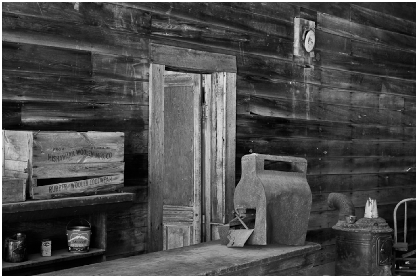
Davey's Merchantile I