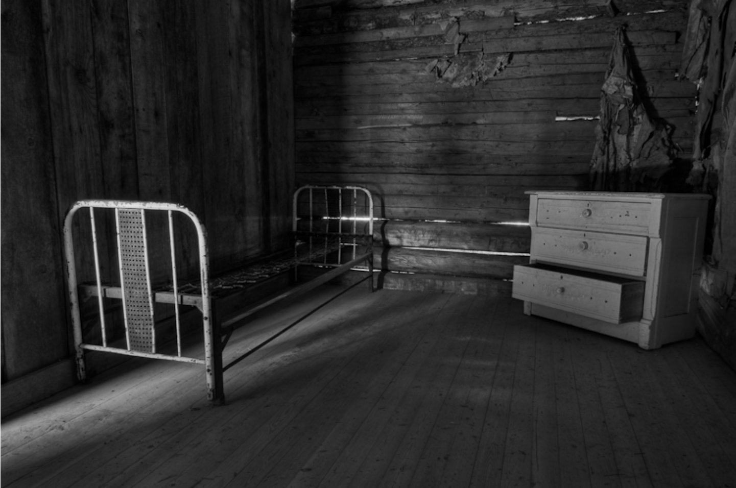
The Adams House